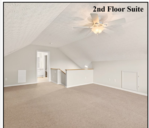
2nd Floor Suite