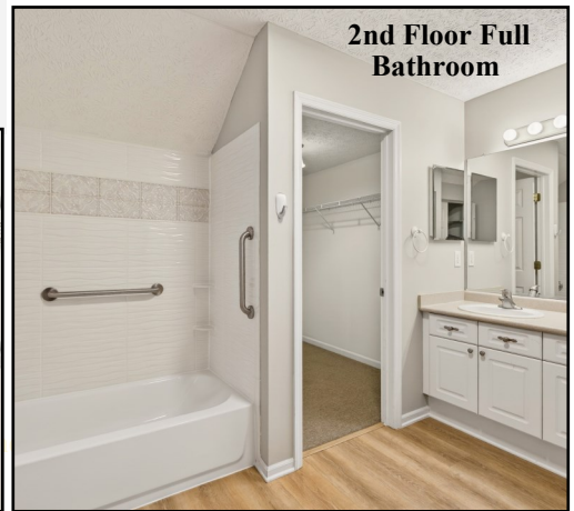
2nd Floor Full Bathroom