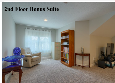
2nd Floor Bonus Suite