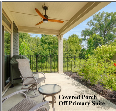
Covered Porch Off Primary Suite