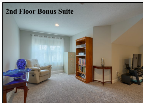
2nd Floor Bonus Suite