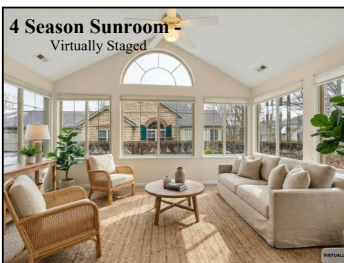
4 Season Sunroom - Virtually Staged