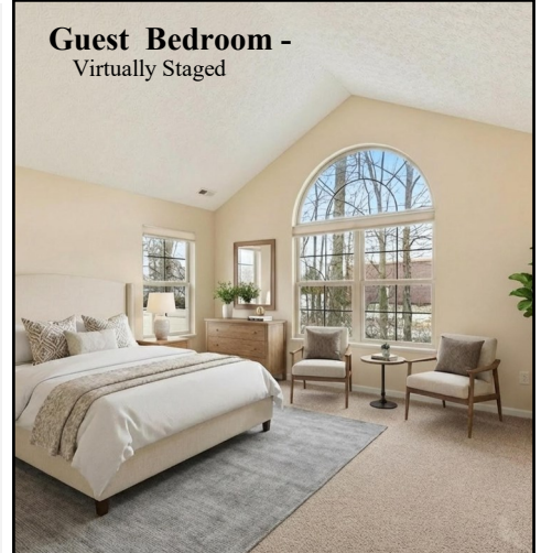
Guest Bedroom - Virtually Staged

Information is deemed to be reliable but not guaranteed