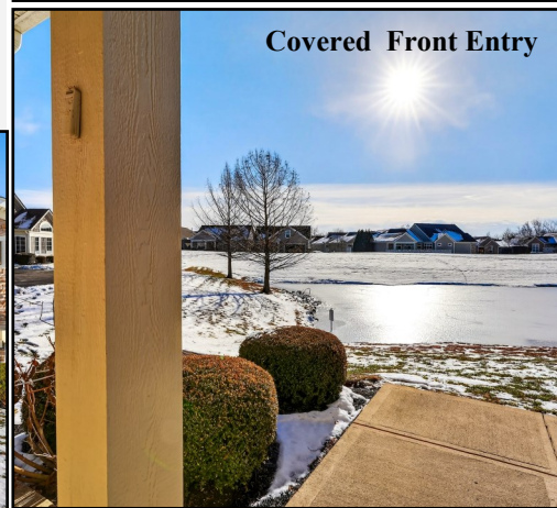
Covered Front Entry