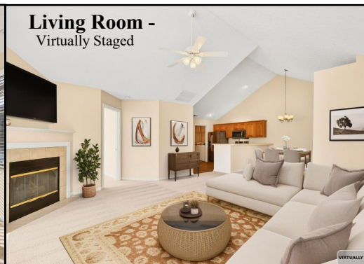
Living Room - Virtually Staged