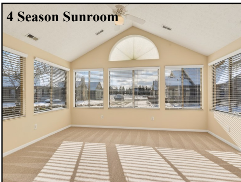
4 Season Sunroom