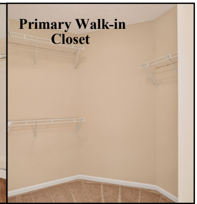
Primary Walk-in Closet