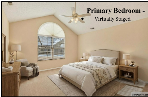
Primary Bedroom - Virtually Staged