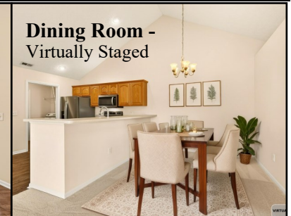
Dining Room - Virtually Staged