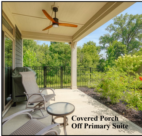
Covered Porch Off Primary Suite