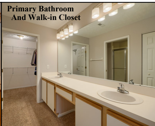
Primary Bathroom And Walk-in Closet