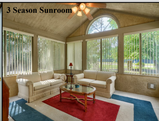
3 Season Sunroom