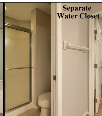
Separate Water Closet