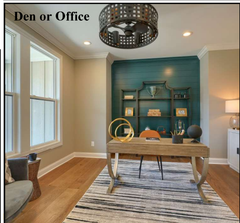
Den or Office