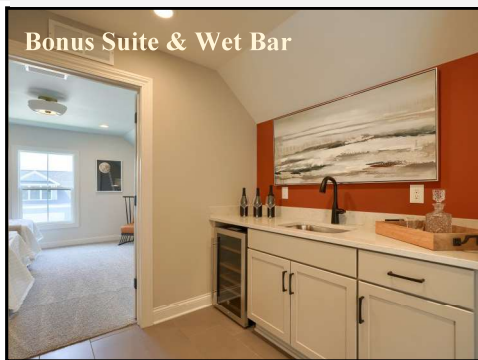
Bonus Suite & Wet Bar