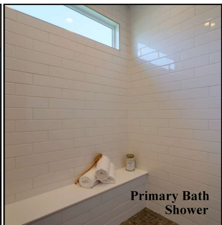
Primary Bath Shower