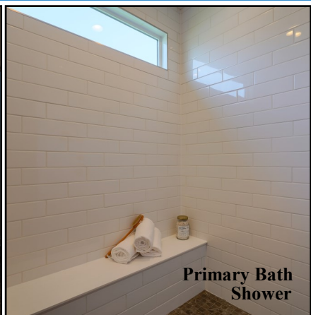
Primary Bath Shower