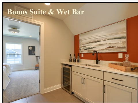
Bonus Suite & Wet Bar