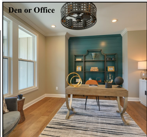
Den or Office