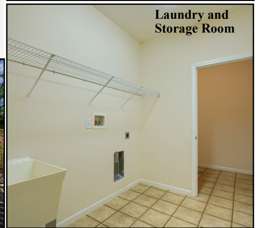
Laundry and Storage Room