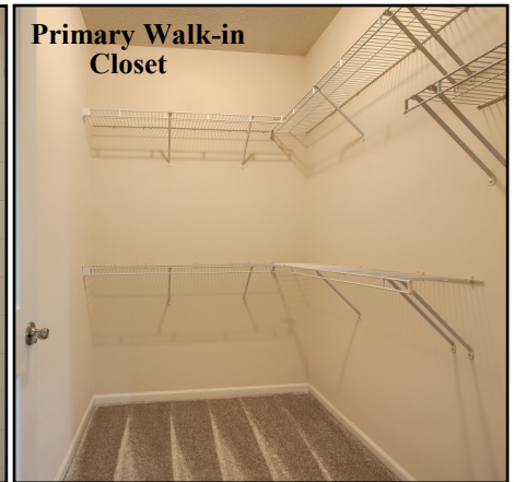
Primary Walk-in Closet