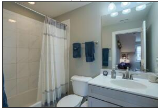
Full bath 2