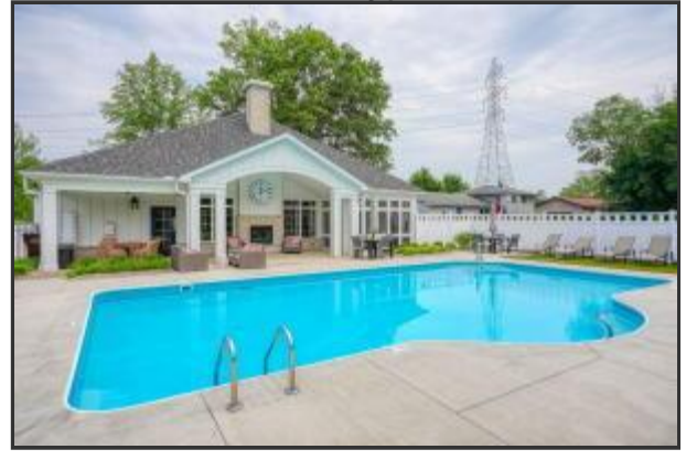
Aerial, pool & clubhouse