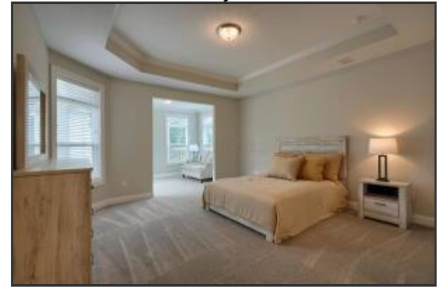
Sitting room off primary