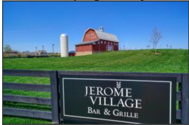
The Courtyards @ Jerome Village