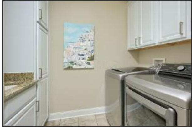
Washer & dryer included