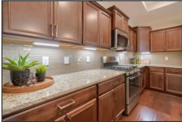
Tile back splash