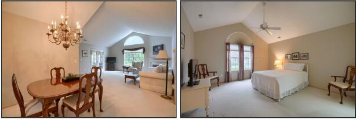
Cathedral ceilings, fan