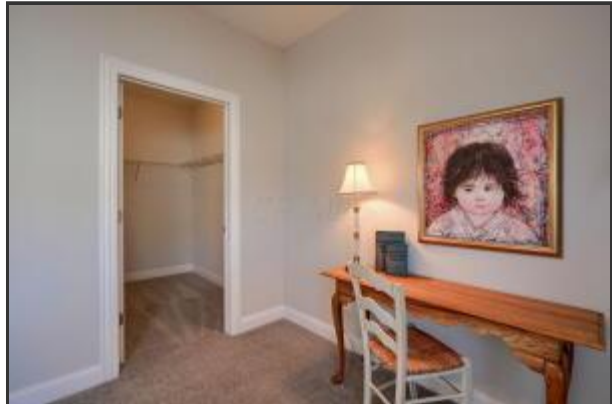
Walk in closet