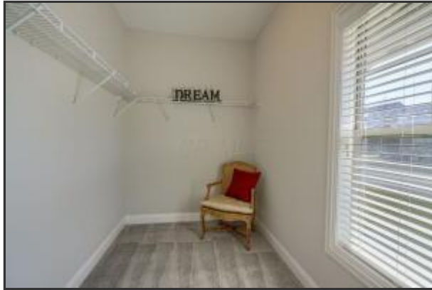
Walk in closet w/window