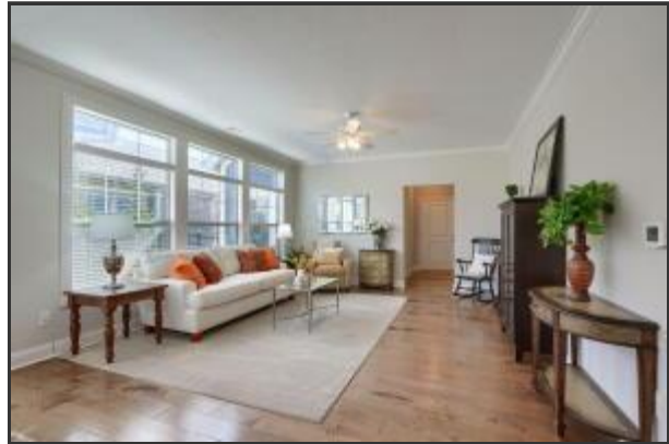
Wall of windows