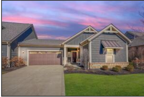
10326 Spicebrush Dr