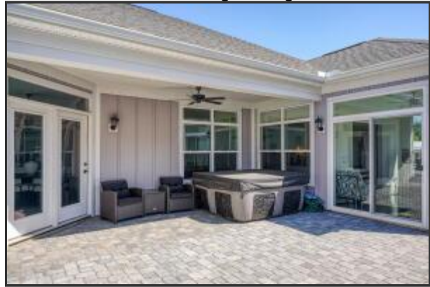
Access from sitting & dining rooms