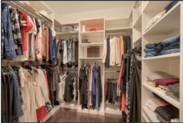
Primary walk in closet