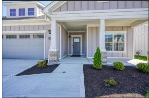
Covered front porch