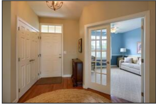
Coat closet & french doors