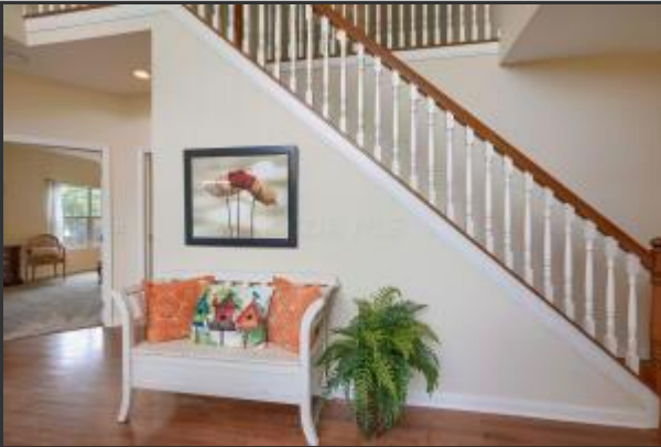
Staircase to loft