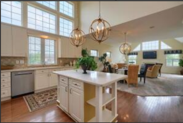
Island with storage