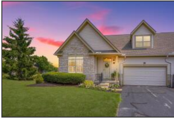
10087 Juliana Circle