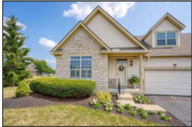
Front of home