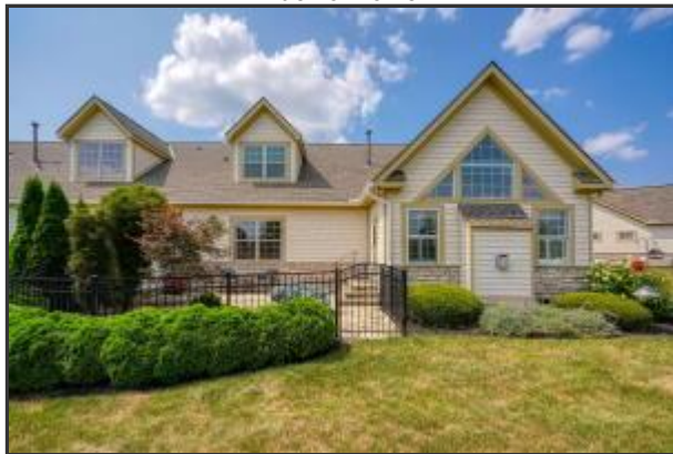
Back of home