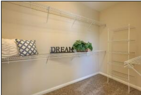
Walk in closet