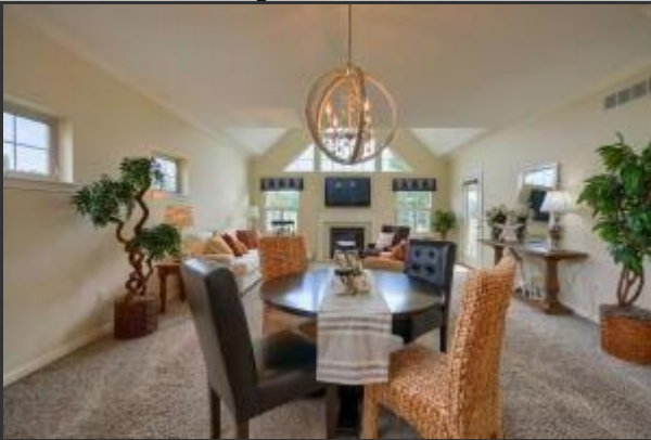
Dining room Chandelier