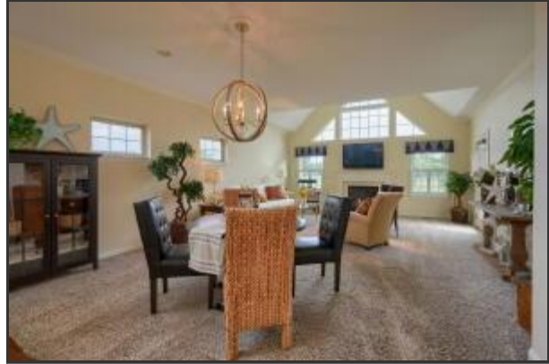
Open floor plan