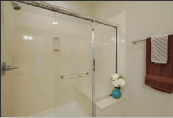
Walk in shower