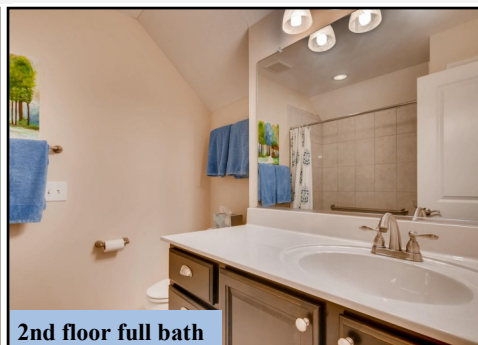
2nd floor full bath