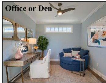
Office or Den