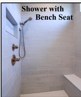
Shower with Bench Seat