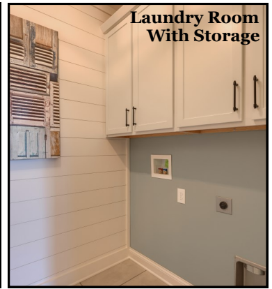
Laundry Room With Storage