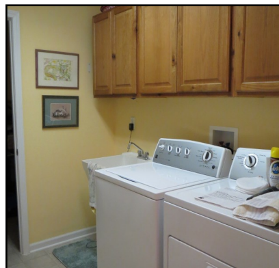
Utility Room w/additional storage