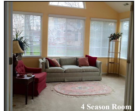
4 Season Room

Information is deemed to be reliable but not guaranteed