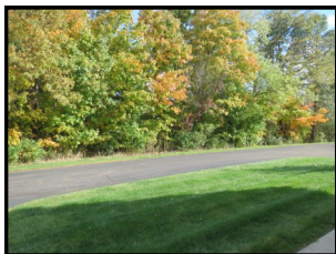
Tree line views

Clubhouse includes fitness center, social room great for Holiday parties and outdoor swimming pool!