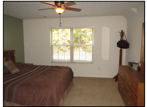
1st Floor Owner Suite