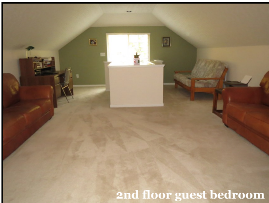
2nd floor guest bedroom