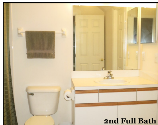
2nd Full Bath