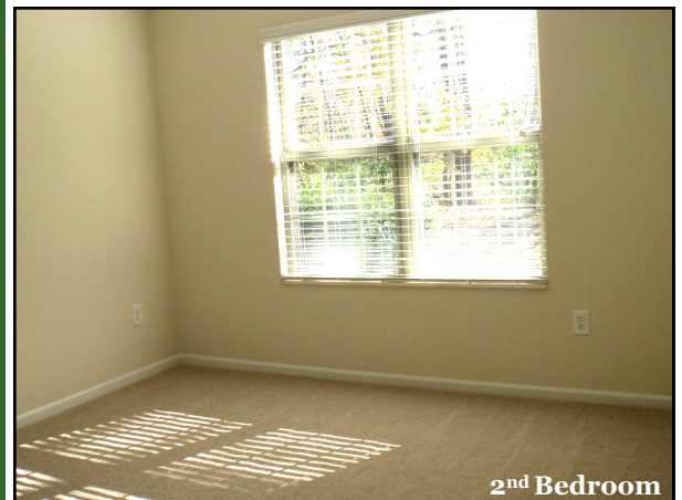
2 nd Bedroom