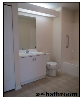
2 nd bathroom