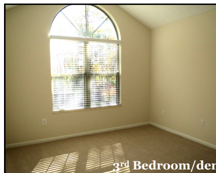
3 rd Bedroom/den