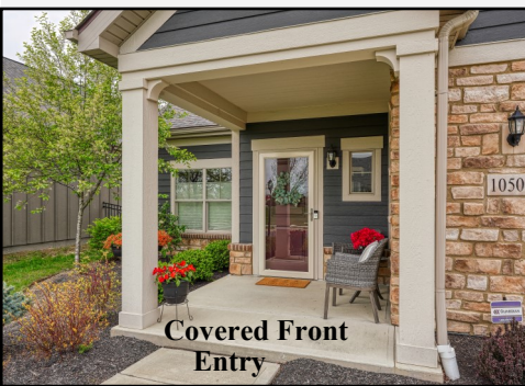
Covered Front Entry