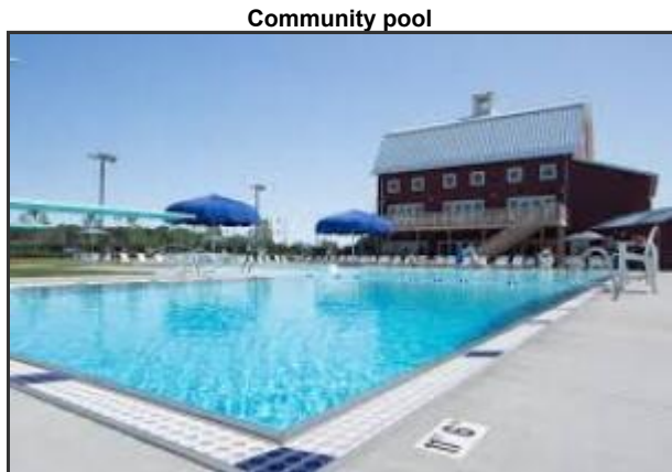
The Courtyards @ Jerome Village