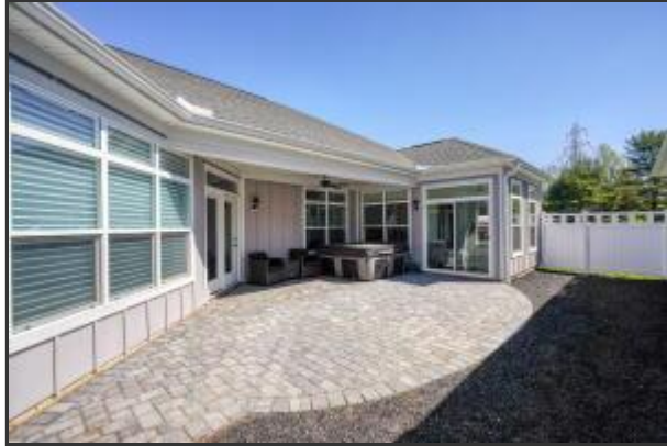
Courtyard with privacy fence