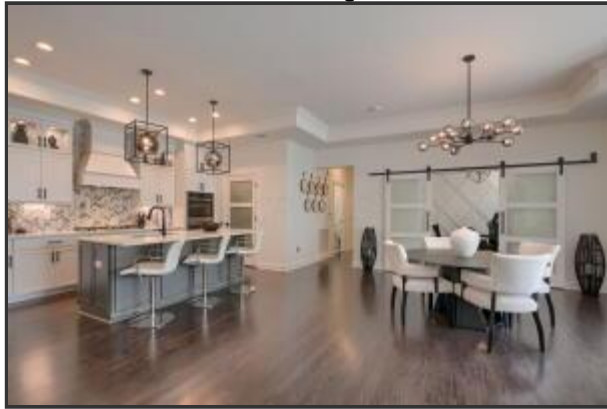
Kitchen & dining rooms