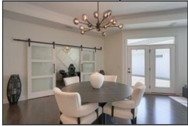
Patio doors to courtyard