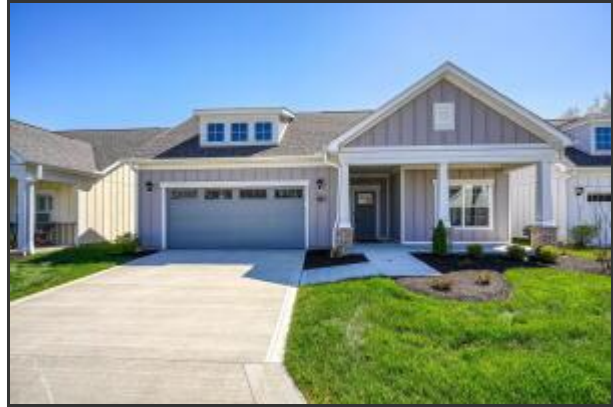
Front of home