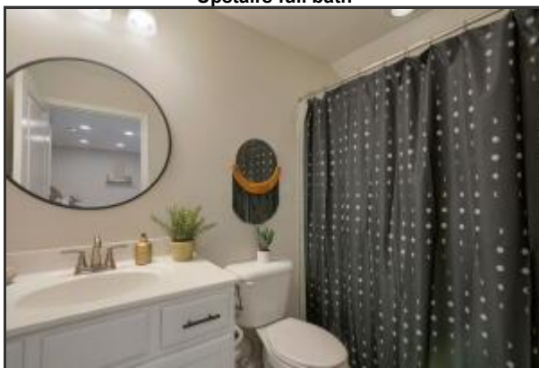
Upstairs full bath