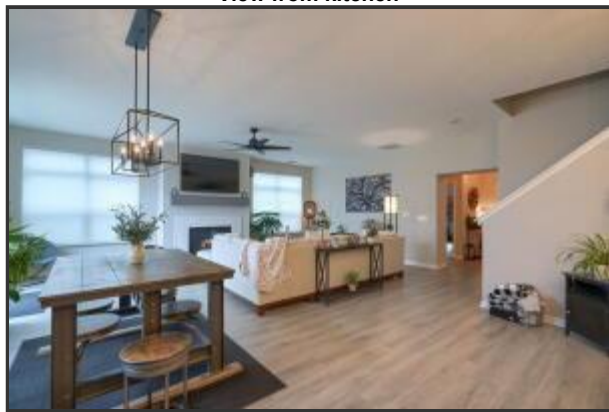
View from kitchen