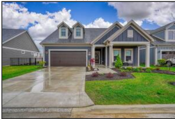
Front of home