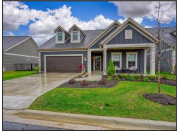
3678 Backstretch Way